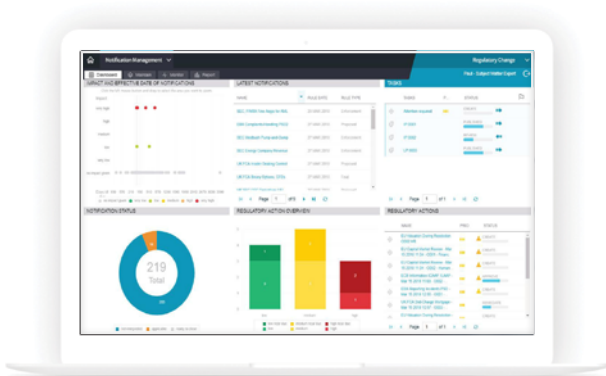
Regulatory Change Management dashboard